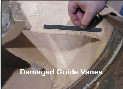
Damaged Guide Vanes