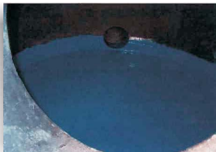
Water box repaired & coated