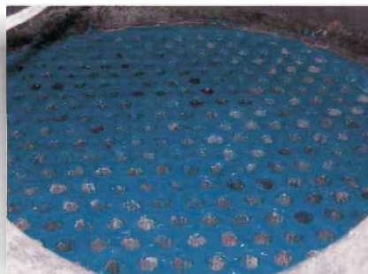
Tube sheet repaired & protected