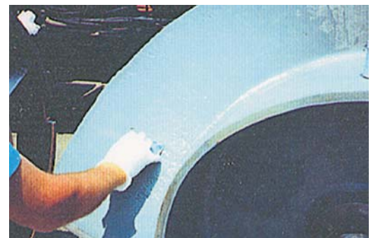
Rebuilding with CeramAlloy CP+