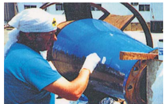
Applying CL+ to one of the diffuser components.