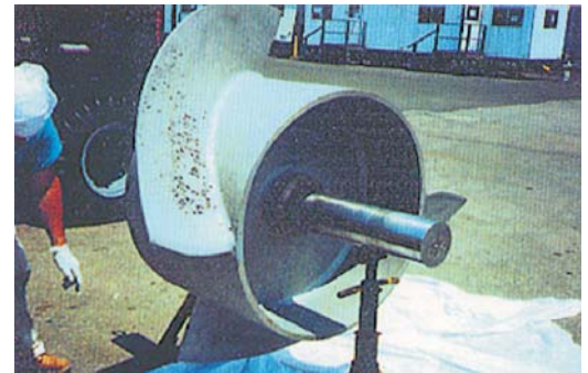
The pump impeller, after grit blasting.