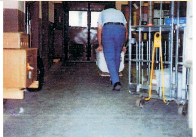
DuraQuartz providing years of trouble-free performance at Postal Center loading area.